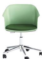
Chromed steel pyramidal base d.640 and hard castors d.50