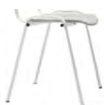
White painted steel 4 legs frame