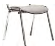
Chromed steel 4 legs frame