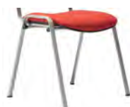
Grey painted steel 4 legs frame